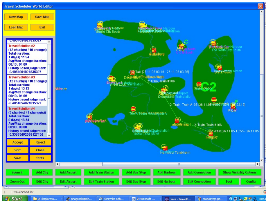
Fig. 2. Screen-shot of the system as it is currently implemented

The optimal solution. In both steps of the algorithm the rule-based systems are used to reduce the search space as far as possible. They prune the search tree considerably, however it may turn out that in some cases they prevent the algorithm from finding the most optimal solutions. This is an unavoidable trade off, since deciding not to use the rules would mean searching through the paramount number of possibilities what would in turn made the planning process cumbersome, if not prevent it from running at all in any sensible time.